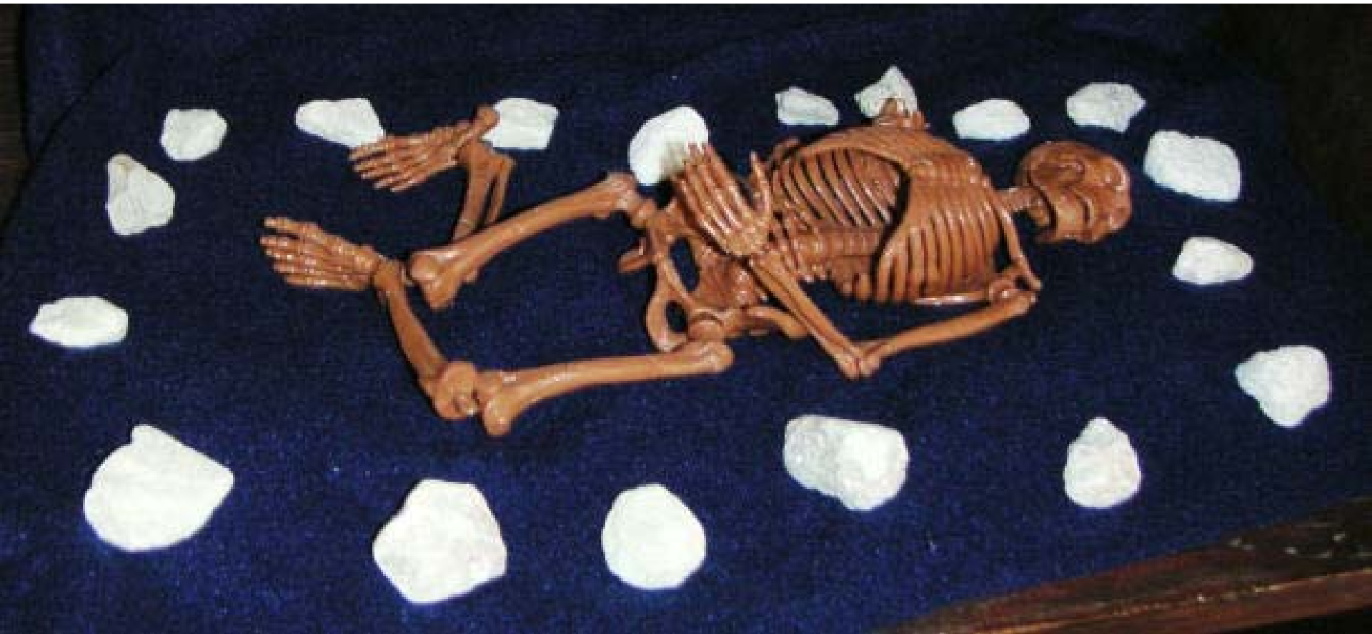
The Neanderthal people, who lived over 30,000 years ago, practiced ritual burial.

Religions offer answers that have been tested by time, in some cases over thousands of years. They are also made stronger by the richness of tradition and the shared experience of community.