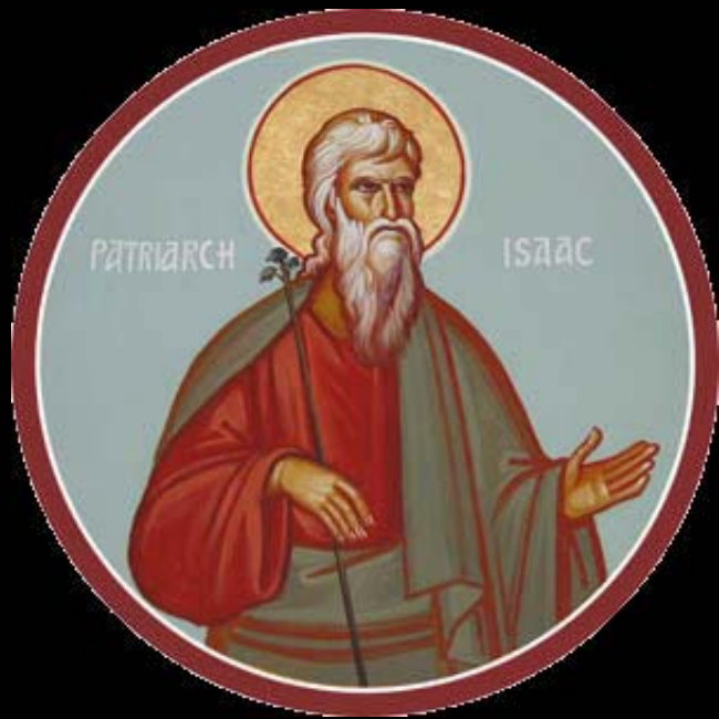
Abraham's son Isaac