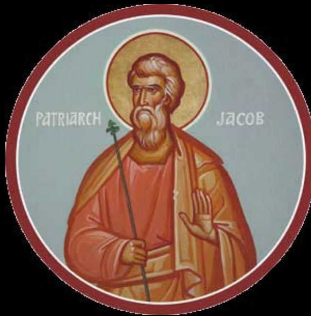
Isaac's son Jacob (also known as Israel)